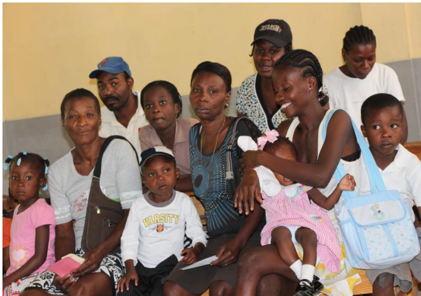
Waiting on the doctor, at our mobile medical clinic in Camp Perrin.

Our WFL board was here recently, and they visited the place where our volunteers were doing a mobile medical clinic; it was